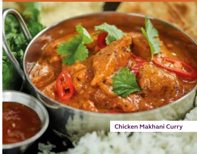
Chicken Makhani Curry

Our creamy medium hot chicken curry topped with red chilli, coriander and spring onion. Served with fluffy white rice, a soft warm naan bread, a freshly cooked poppadom and mango chutney