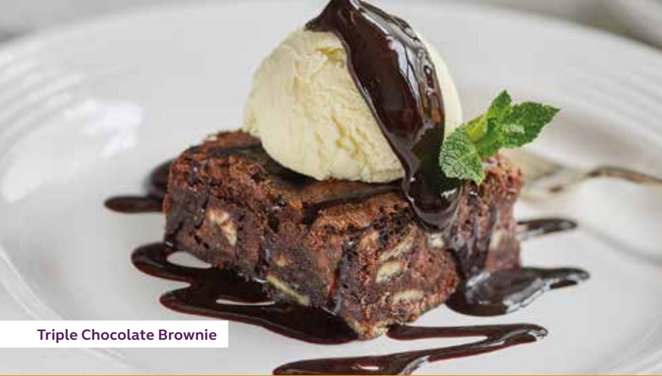
Triple Chocolate Brownie