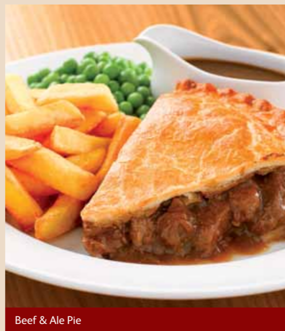
Beef & Ale Pie

A slice of shortcrust pastry pie filled with British beef, slow cooked in Marston's™ Pedigree Ale. Served with chips, garden peas and gravy.