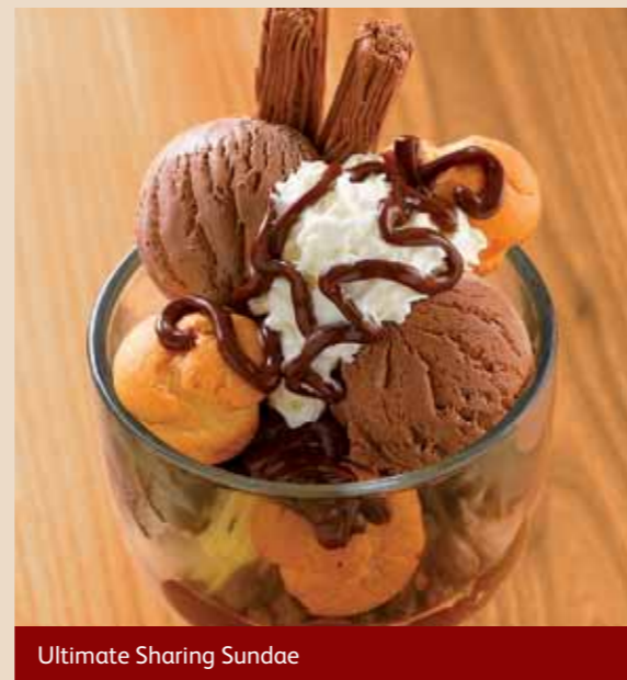
Ultimate Sharing Sundae

Chocolate fudge cake, profiteroles and chocolate crunch, layered with vanilla and chocolate flavour ice creams and chocolate flavour fudge sauce. Topped with a whip of cream and two chocolate flakes.