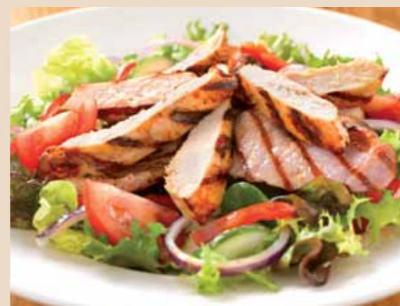
Grilled Chicken & Bacon Salad

Hot slices of freshly grilled chicken breast and bacon rashers on a generous bed of mixed salad leaves, cucumber, red pepper, tomato and red onion with a drizzle of French dressing.