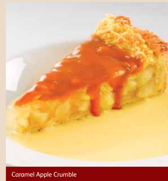
Caramel Apple Crumble

Golden pastry topped with apples, covered with a crumble topping and caramel fudge. Served with your choice of custard, pouring cream or vanilla flavour ice cream.