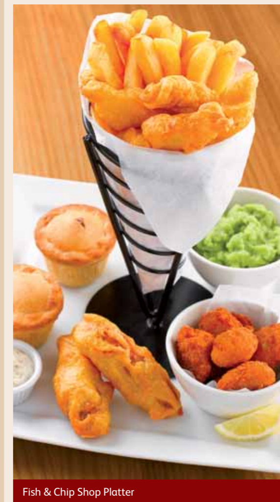
Fish & Chip Shop Platter

Fish goujons, breaded scampi, battered sausages, mini minced beef & onion pies and a large portion of chips. Served with tartare sauce and your choice of mushy or garden peas.